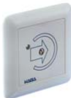
Kaba elolegic reader