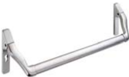
Accessory available for Kaba elolegic c-lever: pushbar for emergency exits and panic exit looks