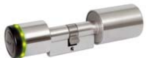
Kaba elolegic digital cylinder