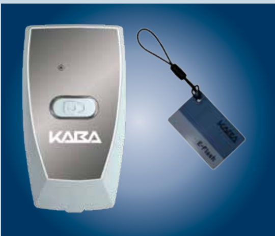
Optional accessories add to the convenience of the system.