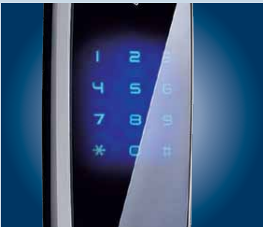
A digital touch pad gives the convenience of entry via password (pin code) in the case of a lost card or for use by guests.