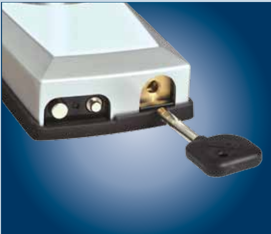
All units come with an external override key, while the deadlock models also come with an internal override key.